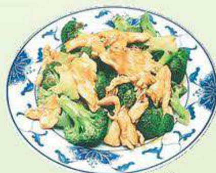
Chicken w. Broccoli