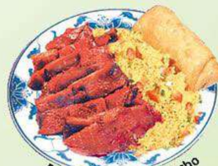
Boneless Spareribs Combo