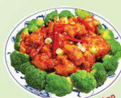
General Gau's Chicken