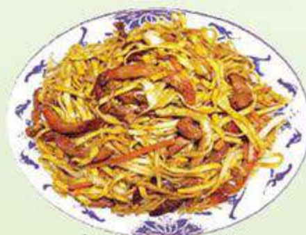
Roast Pork Lo Mein