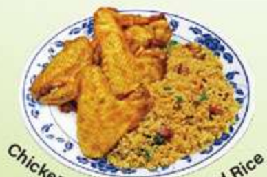
Chicken Wings & Pork Fried Rice

H16. General Gau's or Orange or Sesame Chicken w. White Rice ..... 9.95