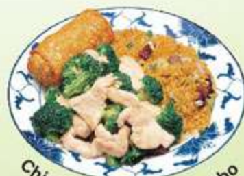
Chicken w. Broccoli Combo