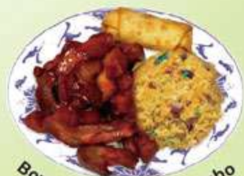
Boneless Spareribs Combo