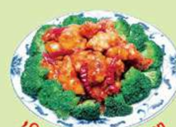
General Gau's Chicken