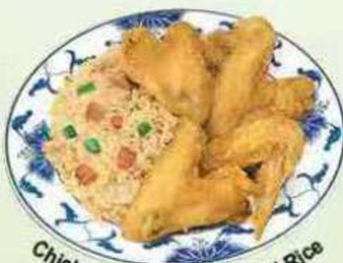
Chicken Wings & Pork Fried Rice