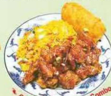
General Gau's Chicken Combo