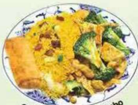
Chicken w. Broccoli Combo