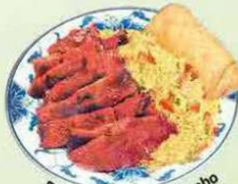
Boneless Spareribs Combo